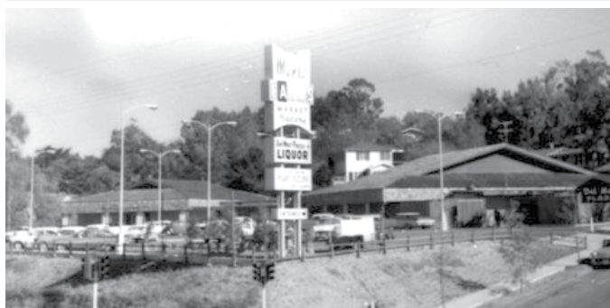
DEL MAR PLAZA 20+ YEARS AGO. DEL MAR HAS COME A LONG WAY!